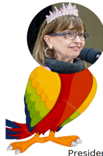
President Nancy 2025 Head Parrot