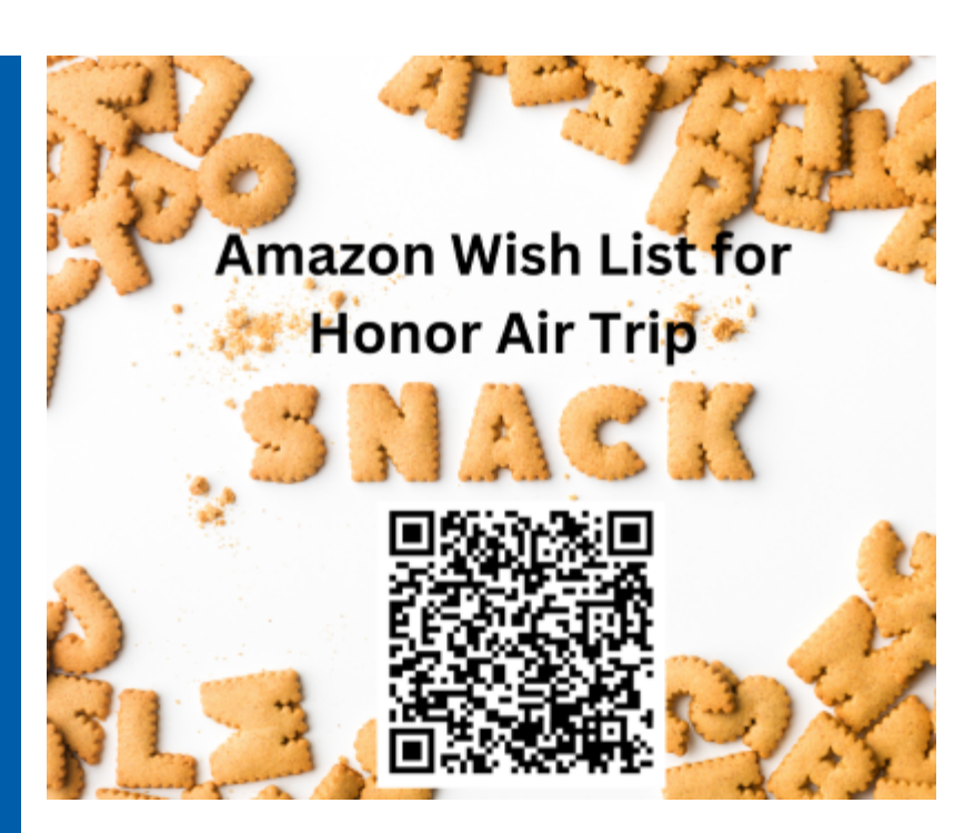
Link to order through Amazon

Our membership cares deeply about the needs and concerns of our members. We don't want to miss an opportunity to reach out