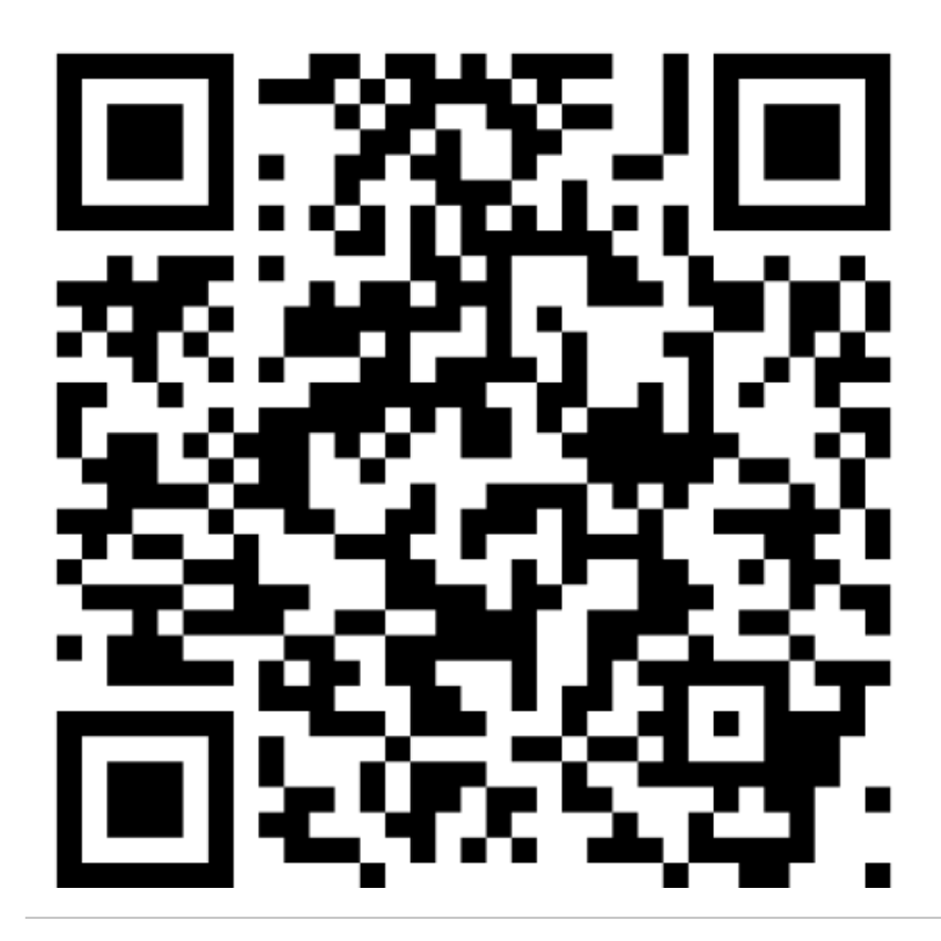
How to Talk with Friends/Family About Hosting Rotary Youth Exchange Students?